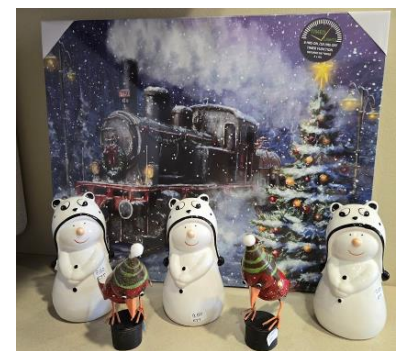
Christmas Sneak Preview