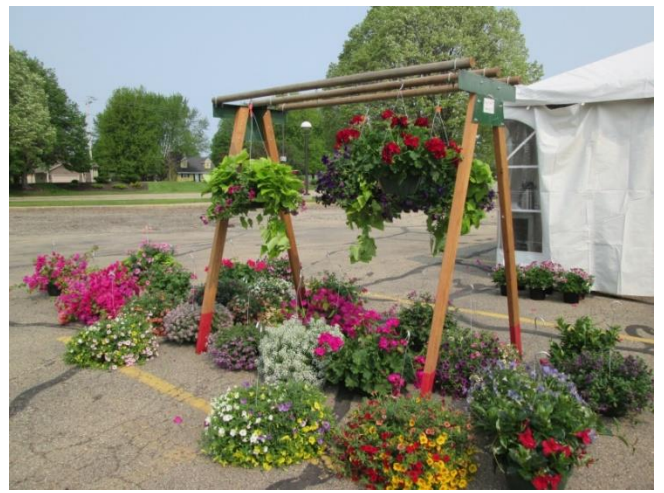
Spring Plant Sale