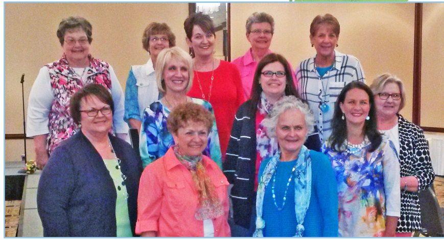
Our 12 models for the Fashion Show, including six from Franciscan Healthcare Auxiliary and six from Gundersen Partners.