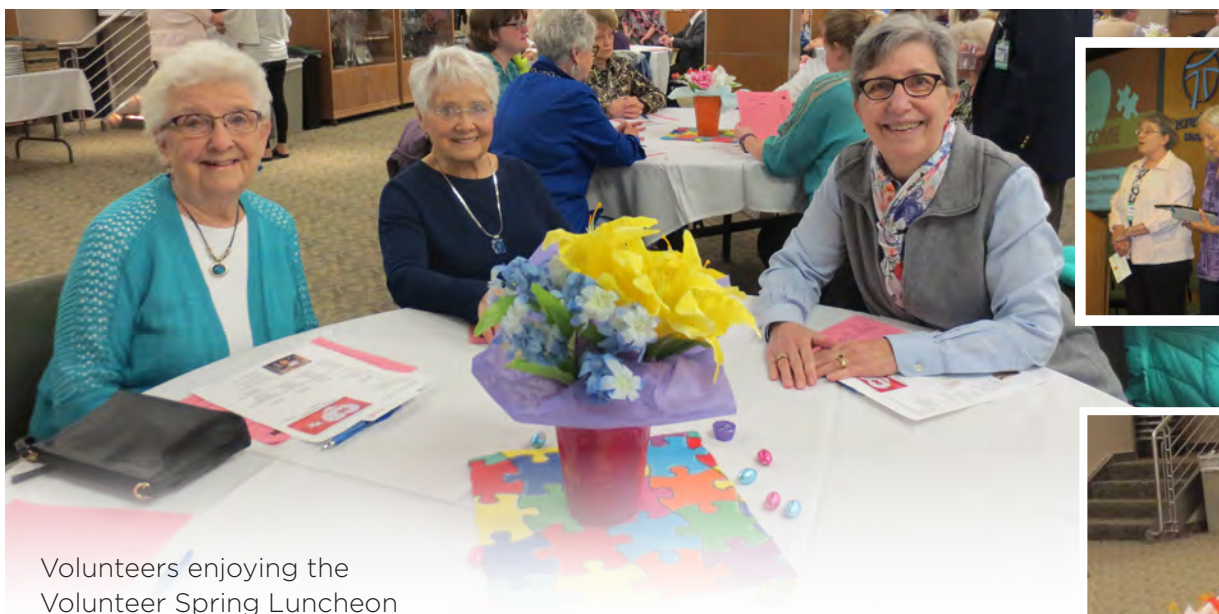
Volunteers enjoying the Volunteer Spring Luncheon