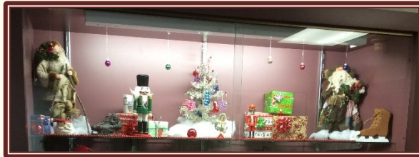
RIGHT: January 2019 Fun in the Snow