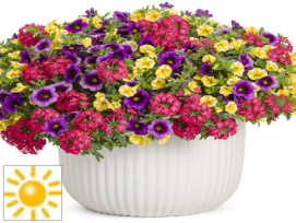
12" Hanging Basket Fruit Salad $30