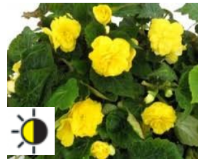
10" Hanging Basket Non-Stop Yellow Begonia $22