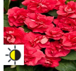
10" Hanging Basket Rockapulco Coral Reef Impatiens $22