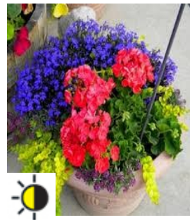
12" Hanging Basket Coral Reef $30