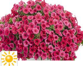
10" Hanging Basket Supertunia Vista Paradise $22