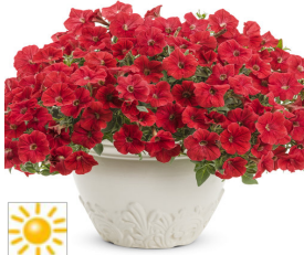
10" Hanging Basket Suptunia Really Red $22

Amount _____ Payment by: check or credit card