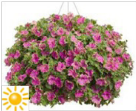
10" Hanging Basket Picasso in Purple $22