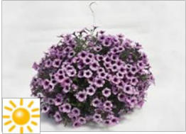
10" Hanging Basket Supertunia Bordeaux $22