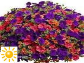
12" Hanging Basket Spicy Sun Combo $30