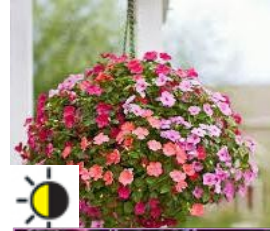
10" Hanging Basket Super Elfin Mixed Impatiens $22