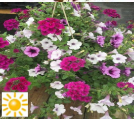
12" Hanging Basket Sangria Sun Combo $30