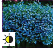
10" Hanging Basket Laguna Sky Blue $22