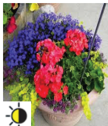
12" Hanging Basket Coral Reef $30