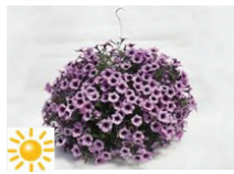
10" Hanging Basket Supertunia Bordeaux $22