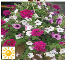
12" Hanging Basket Sangria Sun Combo $30