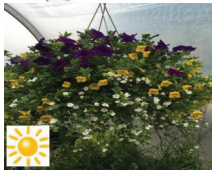
12" Hanging Basket Night Sky Combo $30