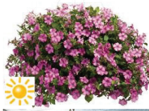
10" Hanging Basket Petunia Raspberry Blast $22