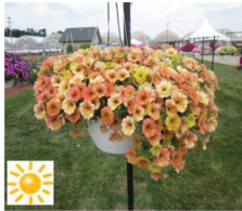
10" Hanging Basket Petunia Indian Summer $22