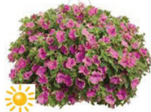
10" Hanging Basket Supetunia Pretty Much Picasso $22