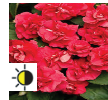
10" Hanging Basket Rockapulco Coral Reef Impatiens $22