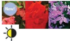
12" Hanging Basket Northern Lights $30