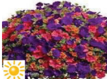
12" Hanging Basket Spicy Sun Combo $30