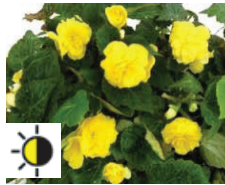
10" Hanging Basket Non-Stop Yellow Begonia $22