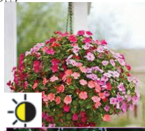
10" Hanging Basket Super Elfin Mixed Impatiens $22