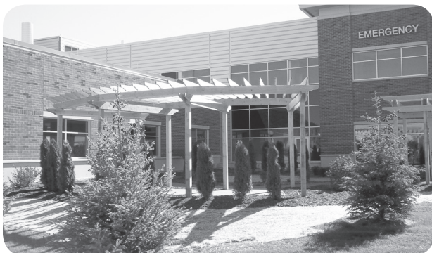
The benches donated by the Auxiliary have been installed in the Healing Garden.