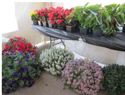
Geranium & Plant Sale