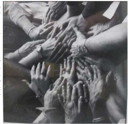
shows the hands of many volunteers at Ascension Mercy