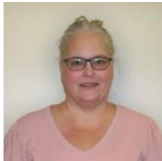
Victoria Partner Volunteer

Welcome to three NEW VOLUNTEERS who will be training for positions at both the hospital ambassador desk and the patient folders in the mailroom!! Super exciting 😊