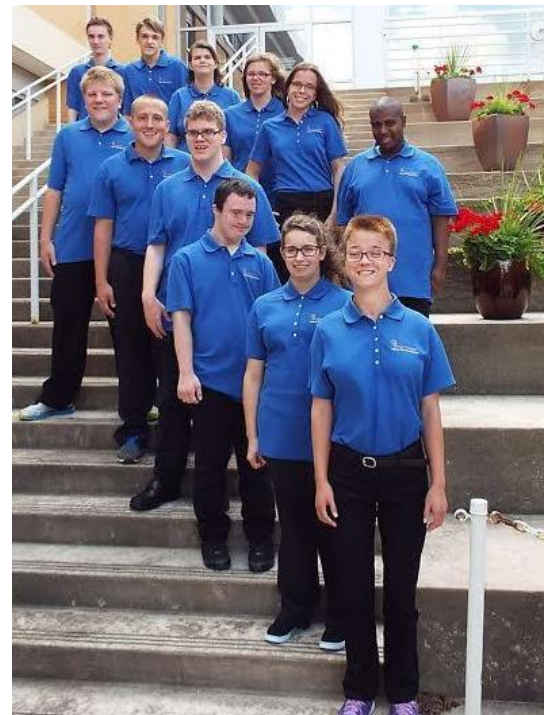
2017 Project SEARCH Intern Graduates

Project SEARCH is a high school transition program; a unique, business led, one year school-to-work program that takes place entirely at the workplace. The focus is on helping youth with disabilities make successful transitions from school to adult life. Mercy Medical Center and Franciscan Courts is the worksite for the project partnering with the Oshkosh Area School District, Goodwill Industries, the Division of Vocational Rehabilitation and other agency support services for the benefit of the interns. Visit http://www.projectsearch.us/Home.aspx to learn more.