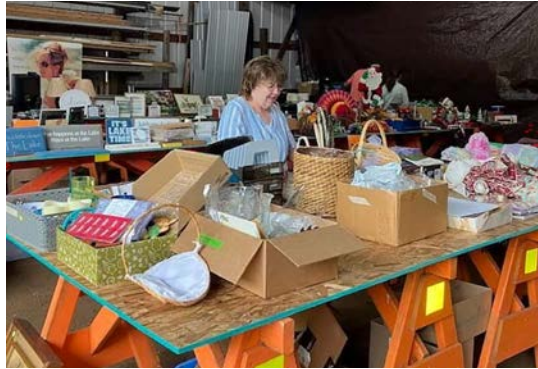
Cumberland Healthcare Volunteer Partners bi-annual garage sale

On June 6 and 7, the Cumberland Healthcare Volunteer Partners held their bi-annual garage sale. Donations were accepted from volunteers as well as items from the gift shop from the past two years that hadn't sold. The volunteers priced their items and dropped them off at the home of two volunteers who graciously allowed us to use their pole shed. The volunteers organized the items and got everything all set up. The garage sale ran from 8 am to 5 pm on Friday and 8 am to 12 pm on Saturday. Their efforts raised over $1,100!