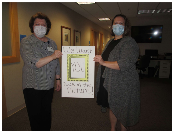
Administration wants YOU back in the picture