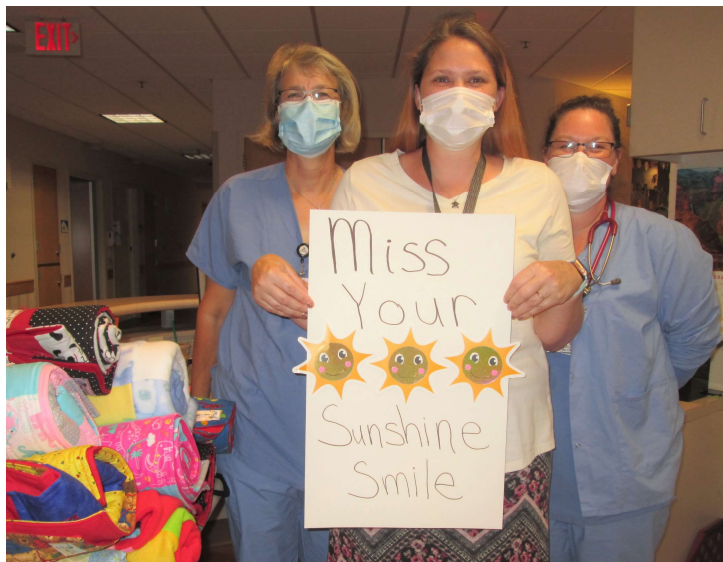
Birthplace Staff miss your sunshine smiles