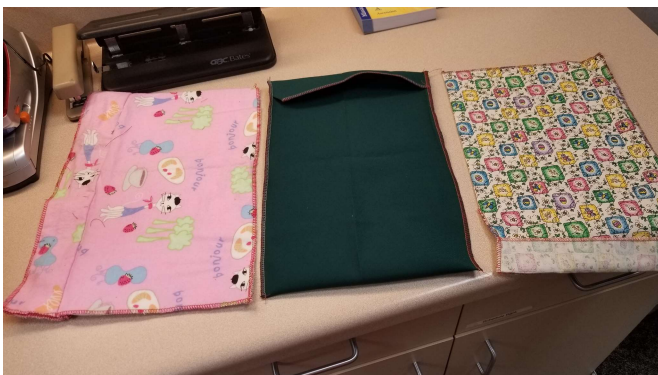
Ice Pak Covers made by Betty Pischke