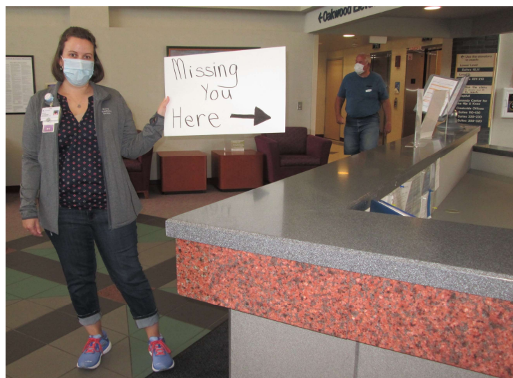
The Oakwood and Information desks sit sadly empty