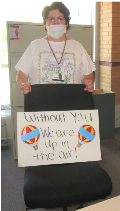
Reception staff are up in the air without you!