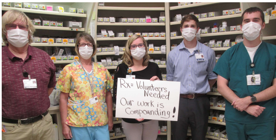
Pharmacy Staff misses your support. Their work is compounding!