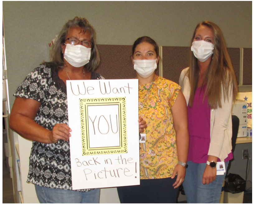
Outpatient Testing wants you back in the picture