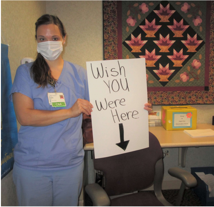
Outpatient Procedures is wishing you were here