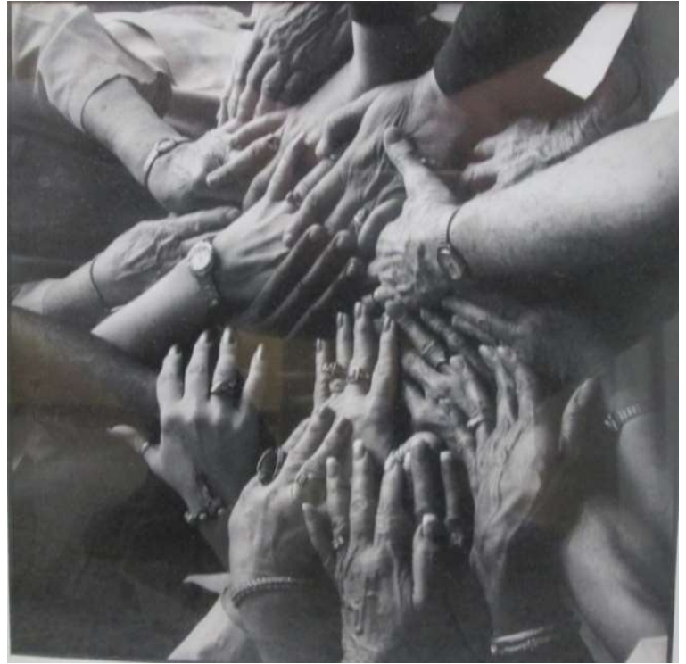
"Alone we can do so little, together so much" -Helen Keller shows the hands of many volunteers at Ascension Mercy

Health Care Advocacy & Upcoming Events Calendar- PG.10