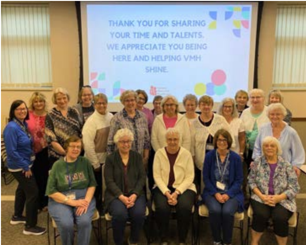
Volunteers were recognized with an appreciation luncheon and program on May 18th.