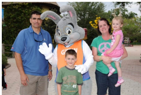
Culp family at Give kids the World!