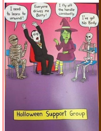
Halloween Support Group