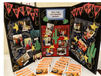
Our display board with the western theme.